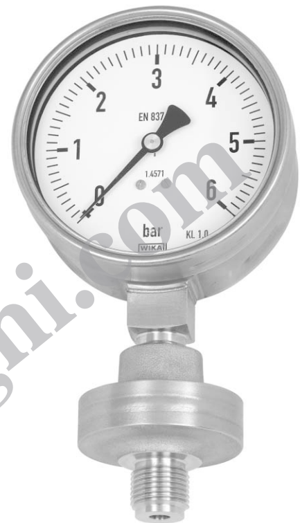
Diaphragm Seal, Economic Design Model 990.38 with Pressure Gauge Model 232.50 NS 100

Material stainless steel 316 L, G ½ B male, optional ½ NPT male